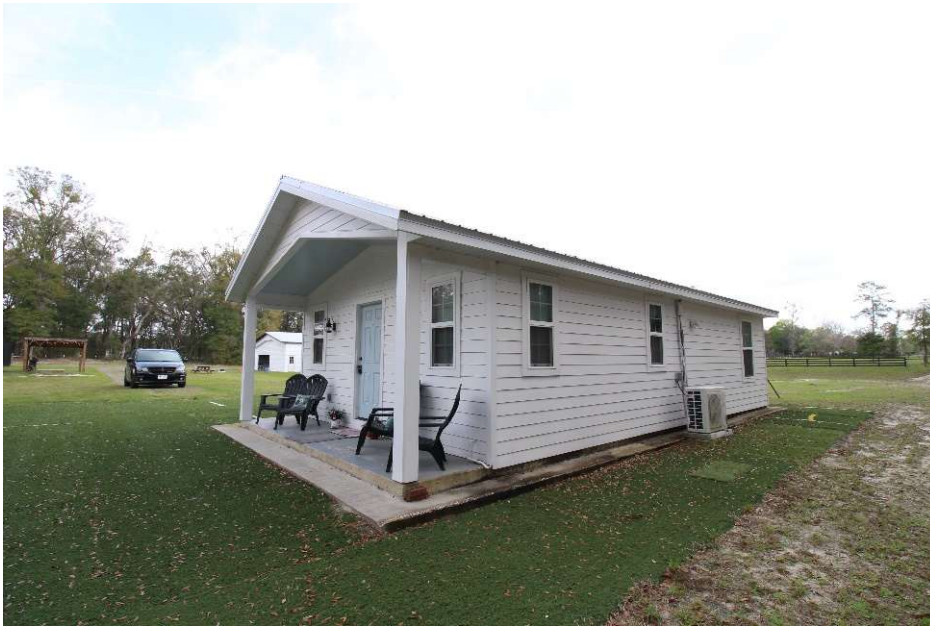
Exterior of Cottage