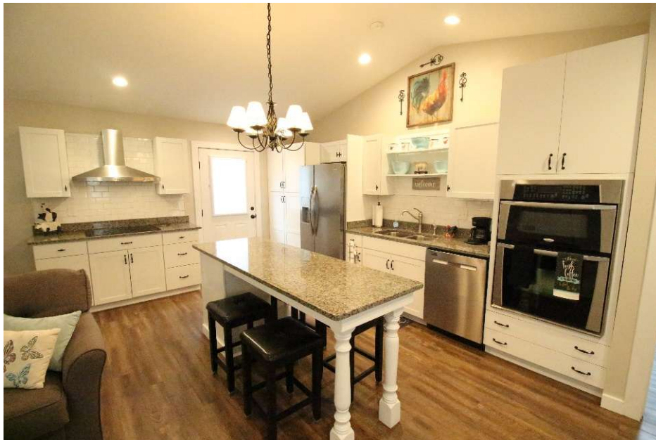
Kitchen w/ Island