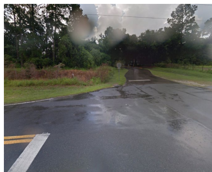
↕ SW 40 th Pl at SW 27 th St