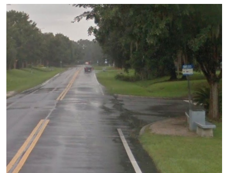
↕ SW 27 th St (looking north)