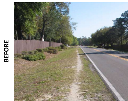
↕ SW 27 th St (looking south)