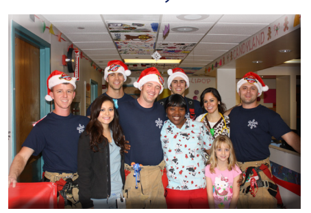
GFR Christmas Carolers volunteered to spread cheer at several local facilities with limited mobility residents and patients.