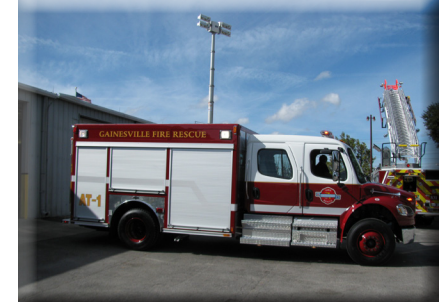
New Air and Light Truck AT1