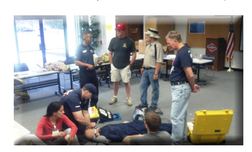
GFR's First Citizens' Fire Academy June 2012