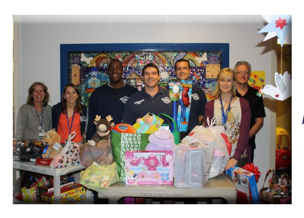
Serving Our Community

C trategic planning Goal 6 requires the department to continually evaluate the distribution of services in Irelation to our stations and facilities and with regard to the resources of our automatic aid partner, Alachua County Fire Rescue. Both fire chiefs work together to evaluate master planning recommendations and identify the need for station and apparatus changes. Currently, the City of Gainesville is developing plans to replace Fire Station 1, which was built in 1961.