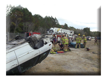
B-Shift Extrication Training

Reeping GFR's fleet of apparatus and vehicles ready for service is a year-long endeavor. Not only does GFR need to maintain its front-line units, we also need to keep reserve apparatus ready for activation as replacement or additional units. This allows GFR to ensure that every station has an available unit even when their primary apparatus are out of service for maintenance or repairs. One of GFR's District Chiefs works closely with the City's Fleet Manager to oversee this project area. During 2012 the City replaced one of the District Chief's command vehicles with a Chevrolet Suburban and the Special Operations Chief's vehicle with a Ford Fusion. Four replacements are being scheduled for 2013 for Fire Safety Inspectors, the Investigative Services Officer, and the Communications Technician.