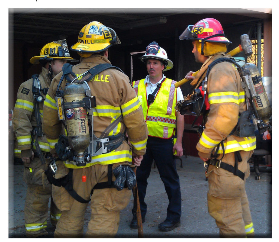
Firefighters preparing to train at the old Gainesville Police Department building. Personal Protective Equipment (PPE) includes helmets, bunker gear, gloves, boots, self-contained breathing apparatus (SCBA), radios, and personal alerting devices to use if they are trapped or injured.

The Health and Safety Committee met three times during 2012 to evaluate on the job injuries, safety equipment needs, and environmental safety needs for firefighters. They reviewed injury reports and determined that 31 of 57 incidents occurred while responding to or returning from calls for service; only three injuries occurred during training; and the remainder were issues discovered during health testing or were unrelated to training or calls for service activities. During August, 136 personnel completed annual health assessments and 18 completed their five-year physicals. The Health and Safety program also ensures that safety equipment, such as flashlights, boots, bunker gear, helmets, gloves, and other items are regularly inspected, repaired, and replaced.