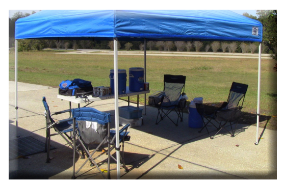
A Rehab Station set up with medical monitoring equipment, nutritional replacement, and liquids for hydration. Rehab Stations can be used during firefighting and other activities to prevent illness and injury.

The Physical Fitness Committee also met three times during 2012. Their efforts are guided by the International Firefiahters Association of International Association of Fire Chiefs Wellness Initiative. This initiative is recognized nationwide as a framework for departments to promote activities and practices that help firefighters develop and maintain personel wellness in an effort to combat health risks from both the work environment and daily lifestyle choices. The program utilizes department personnel who are trained and certified as peer fitness trainers (PFTs) who provide classroom instructions on all aspects of fitness, nutrition. includina exercise and PFTs may also work one-on-one with department employees to help them target specific areas of fitness efforts.